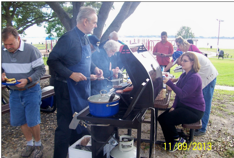
Parish Picnic on October 17 at Clear Lake Park at 11:00am.